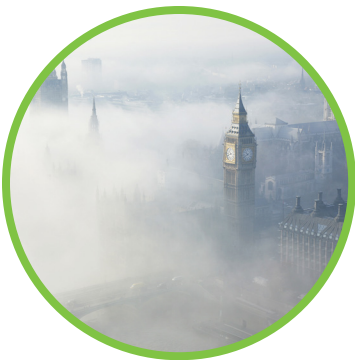
London's 'great smog' leaves at least 4,000 dead.

1950 84 countries worldwide; approximate start of 'the great acceleration' – massive increase in material use such as hydrocarbons, cement, and plastic; 30 per cent of world's population urban; Union Carbide staff invent polyethylene garbage bags.