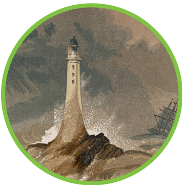
John Smeaton (who built Eddystone Lighthouse) declares himself first 'Civil Engineer'.

1770s to 1830s Launch of Industrial Revolution in Britain (textiles, steam power, iron); peak of transatlantic slavery with an average of some 78,000 enslaved people brought to the Americas each year.