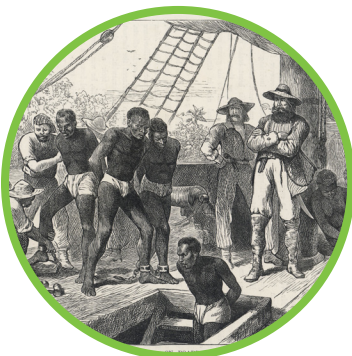
Britain bans African slave trade; steamship invented.