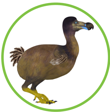
Extinction of the dodo bird, Mauritius.