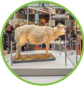
First cloning of a mammal (Dolly the sheep).