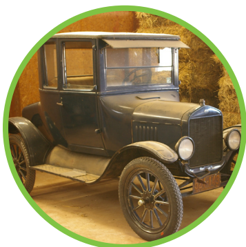
Ford's first Model T.