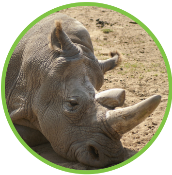
Last male northern white rhinoceros dies (species extinct).