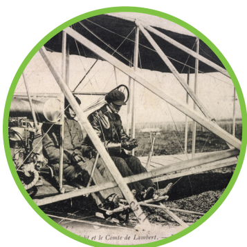
Wright Brothers inaugural flight.