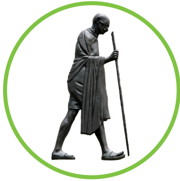
Mahatma Gandhi leads Salt March from Ahmedabad to Dandi.