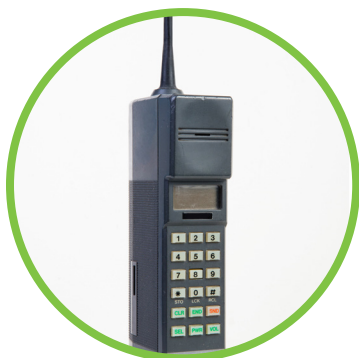
First handheld mobile phone demonstrated (Motorola).