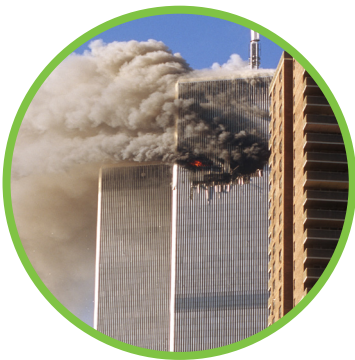
9/11 terrorist attacks.

2001 China joins WTO; Enron scandal; Human Genome Project publishes working draft; start of the Acumen Fund by Jacqueline Novogratz; Stockholm Convention on Persistent Organic Pollutants.